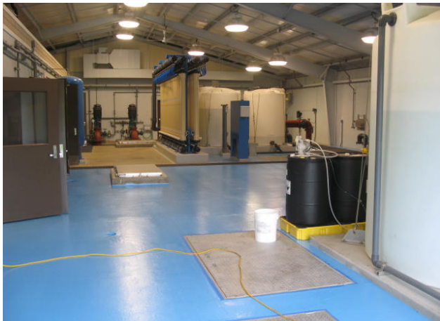
The Horn Creek Process Room