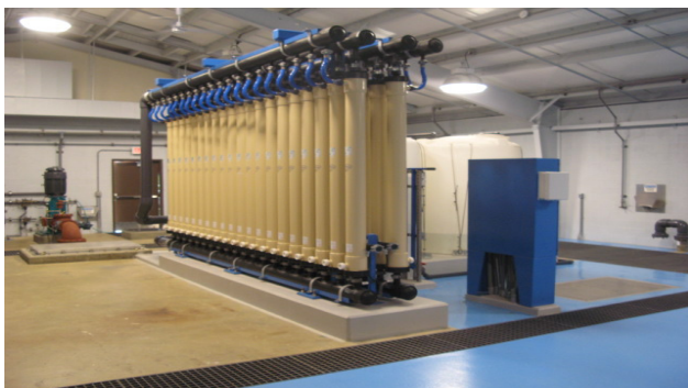
Horn Creek Micro-Filtration Membrane Modules. Each Module Contains 6,500 Membrane Fibers!

Cryptosporidium is a microbial pathogen found in surface water throughout the world. Surface water supplies are particularly vulnerable if they receive runoff or are exposed to human or animal wastes. Since wildlife inhabits the Horn Creek Watershed, PCJWSA monitors for Cryptosporidium and has done so since 2009. After testing 24 samples, it was demonstrated that there are low levels of Cryptosporidium in our source water. PCJWSA will not need to monitor for Cryptosporidium again until 2017. Ingestion of Cryptosporidium may cause Cryptosporidiosis , an abdominal infection. Symptoms of infection include nausea, diarrhea, and abdominal cramps. We encourage Immuno-compromised individuals to consult their doctor regarding appropriate precautions to take to avoid infection. Cryptosporidium must be ingested to cause infection and may be spread through other means than drinking water.